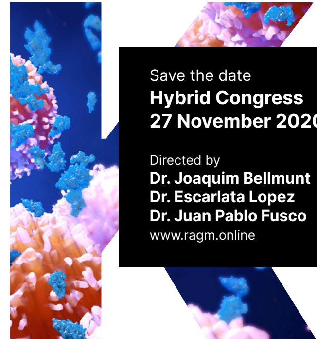
Round Table 3: Kidney Cancer

Save the date Hybrid Congress 27 November 2020