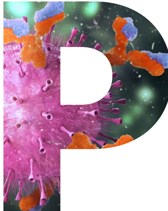
Round Table 2: Prostate Cancer