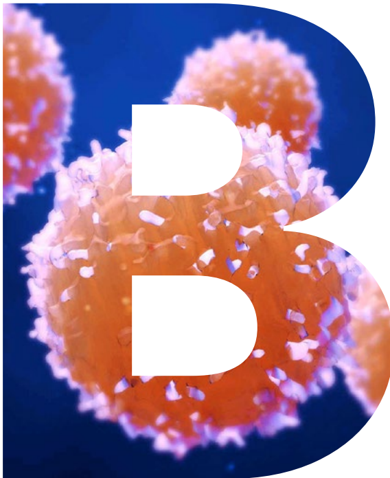
Round Table 1: Bladder Cancer