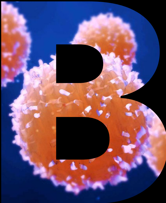
Round Table 1: Bladder Cancer