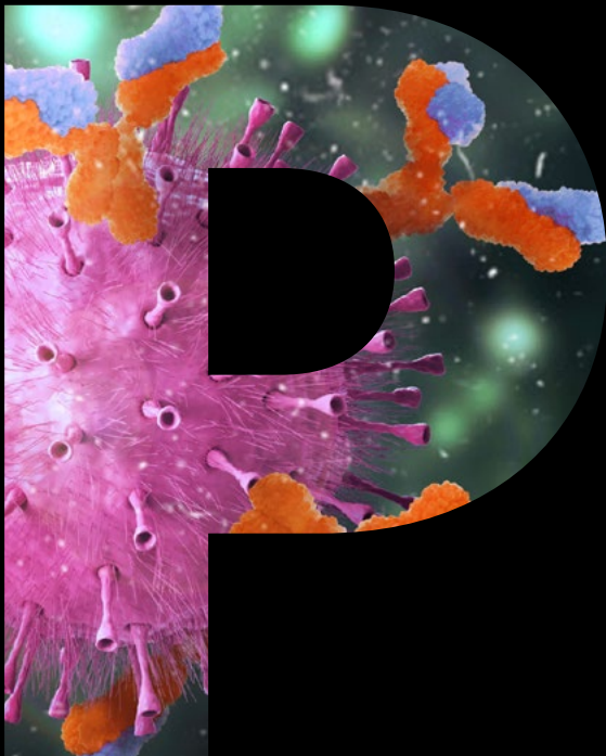
Round Table 2: Prostate Cancer